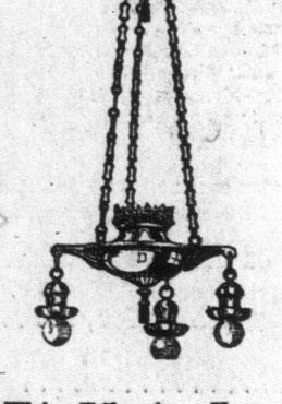
This Effective Four-Light Fixture at $13.50

Portable Lamps have a way of making home cosy and are not surpassed by any other lighting fixture. Prices from $4.00 up to $35.00, in wood and metal, with glass or silk shades.