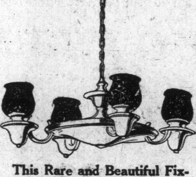
ture Priced at $36.00,