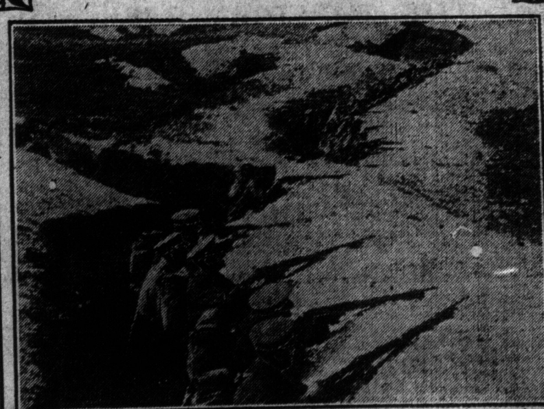
The Chalk Trenches