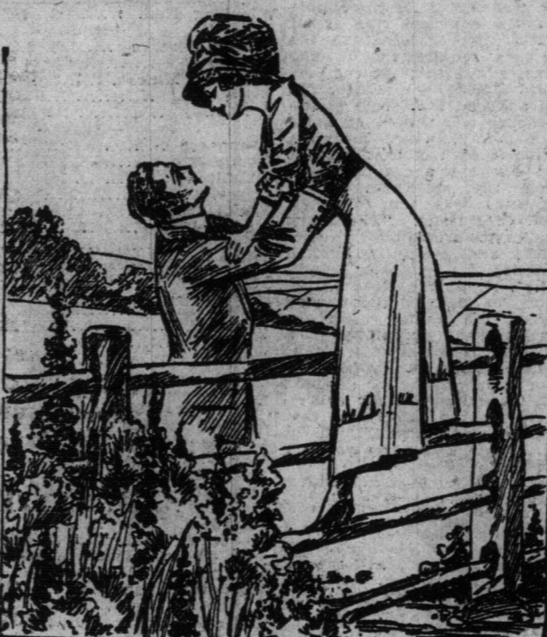
"Singing, over them, come over, For the bee has quit the clover, And your English Summer's done."

That's it exactly; substitute "Canadian" for "English," and Kipling's verse just expresses the sentiment that is pervading this store. Summer is done; the tingle of Autumn in the air tells you that the season has begun to change. This store is, if anything, ahead of the season this year. New goods came in early, and at the present time you'll find Fall stocks awaiting you on every floor. If you want to be abreast of the season you'll be paying us a visit to-morrow.