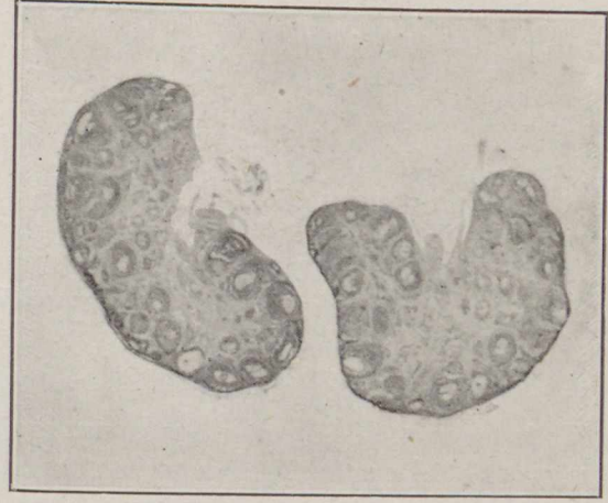
Fig. 3.—Ovaries of a rat 27 days old, 30 grm. Injected with alcohol soluble fraction in potency test. Strong positive reaction. Killed on the fifth day. Note the mild hypertrophy and wealth of follicles. Corpora lutea absent.

In another instance a senile rat which was studied daily by the vaginal smear method showed a continuous cornification phase. After