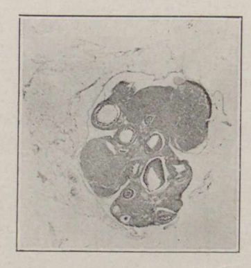
Fig. 4.—Ovary showing corpora lutea. Rat 28 days old; 37 grm. weight. Injected with the equivalent of 3 grm. placenta, as a relatively crude extract made by use of 50 per cent acetone.