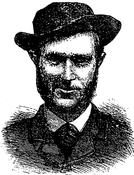
PATRICK O'DONNELL, THE SLAYER OF JAMES CAREY.