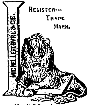
Lion "L" Brand.