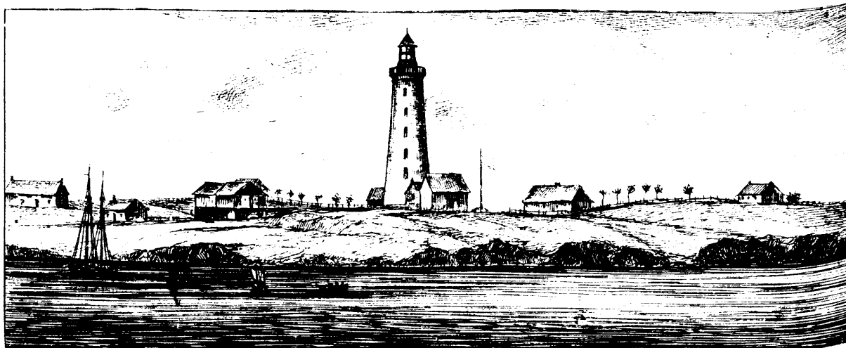
LIGHT-HOUSE, S. W. POINT, ANTICOSTI.