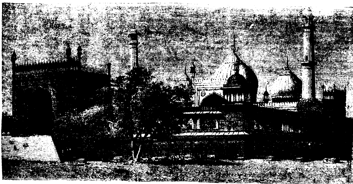
THE JUMNA MUSJID.