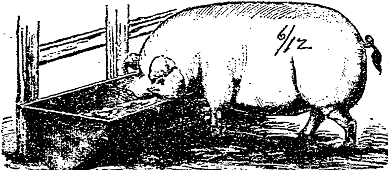
Registered.—Infringement upon any of our Patents will be rigorously prosecuted.