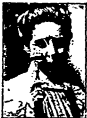
Trade Mark Registered.

Stationers, Blank Book Makers and Printers, 1755 and 1757 Notre Dame Street, MONTREAL.