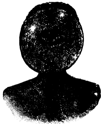
ONE OF THE WAHYEVA OF UHOMBO (BACK VIEW).