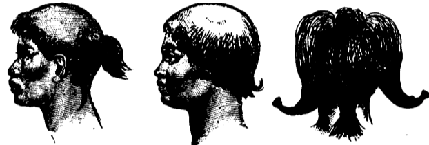
NATIVES OF UBUIJE.

The following entries are from my note-book:— “Livingstone called floating down the Lualaba a foolhardy feat. So it has proved, indeed; and I pen these lines with half a feeling that they will never be read by any man. Still, as we persist in floating down, I persist in writing, leaving events to an all-gracious Providence. Day and night we are stunned with the dreadful drumming which announces our arrival and presence on their waters. It may well be said we are ‘running the gauntlet.’ “Our terrors are numerous. First, the rocks and rapids, the plunging cataract, and whirling pool. Then the sudden storm, which now blows each day up river, and soon raises heavy, brown waves, like those of a lake; but the greatest