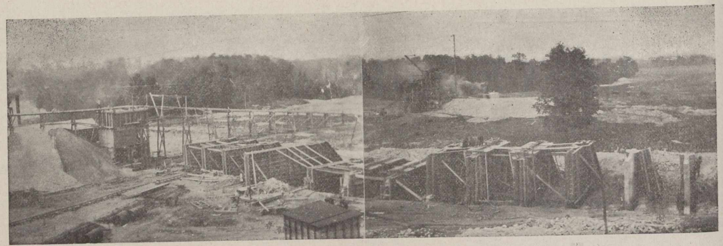
Fig. 1.—South Half of Dam at Eugenia Falls, as it Appeared on September 15th, 1914.

dumped into the hopper of a screening and washing plant, consisting of two revolving conical screens of 3%-inch and 3-inch diameter holes respectively with automatic sand hopper of the Gilbert type. The product of this plant was hauled over the dam and gravel and sand bins on an inclined trestle by a small hoisting engine, and was either dumped directly into the bins or into storage piles immediately adjacent. By operating this plant day and night, the entire amount of sand and gravel required was furnished by about the last of October, and the derrick was then transferred to the storage piles for loading the bins, the difficulties due to operating a washing plant in freezing weather being thus avoided.