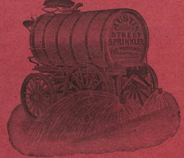
Austin Street Sprinkler.

Rock Crushing Plants, Road Rollers, Road Graders, Concrete Mixers, Scrapers, Plows, Sweepers, Sprinkling Wagons, Dump Wagons.