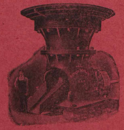
Gyratory Rock Crushers. Complete Stationary or Portable Plants.