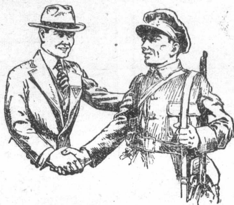
The Y.M.C.A. will keep its chain of Service unbroken till the end.

We ask now your continued sympathy and support for Red Triangle Service for our Soldiers during demobilization, and for Y.M.C.A. work for Canada generally during the Reconstruction period. The Annual Red Triangle campaign will be held throughout Canada May 5th to 9th, 1919. The objective is $1,100,000.