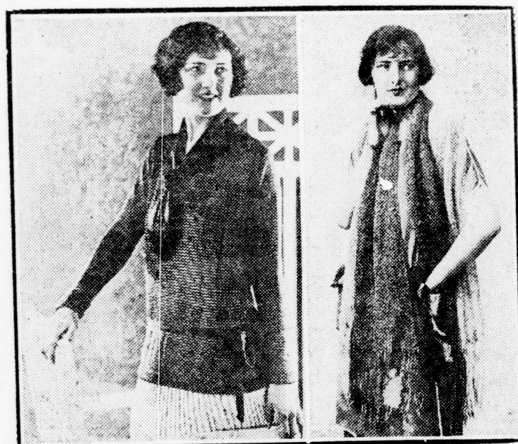
This photograph shows on the left the latest style in knitted golf coats for ladies and on the right the latest thing in ladies' scarfs