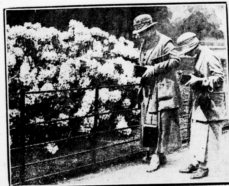
The wonderful Rhododendrons of Hyde Park are now in full bloom, and like the ladies in the above photograph many persons stop to take a picture of them