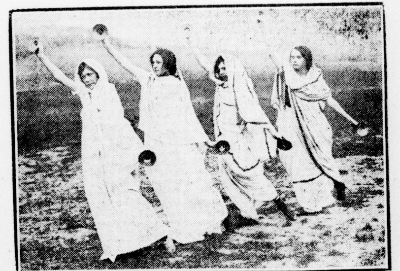
Indian dancers in "The Tableau of the Union Jack", photographed at the fourth annual Castleford Pageant and Folk festival