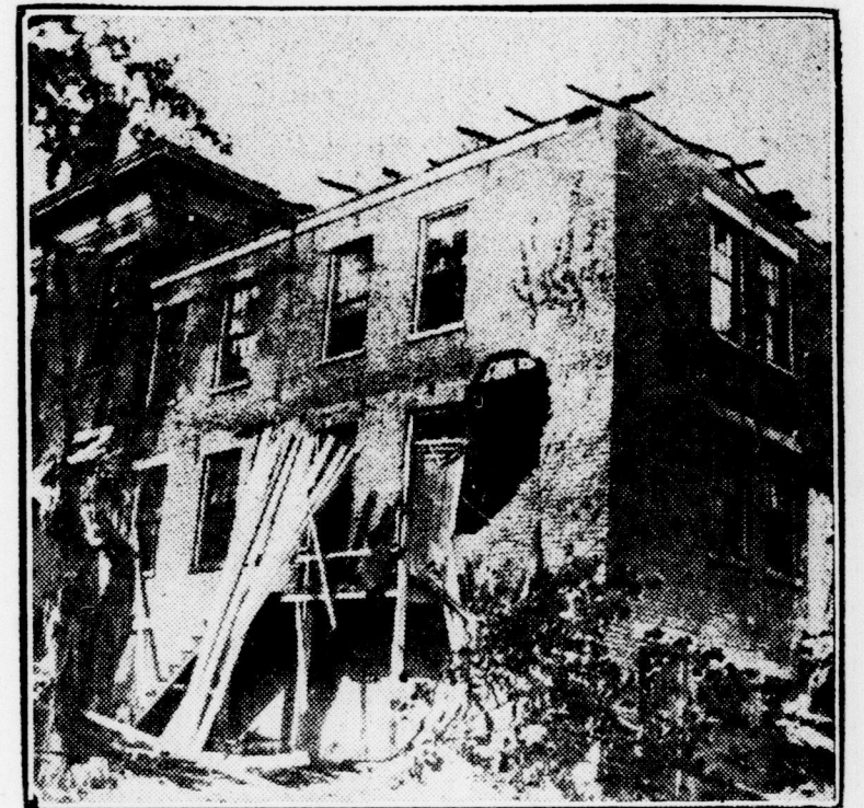
Above is shown one of the many houses wrecked in Oxford, Ohio, when a tornado swept over southern Ohio recently