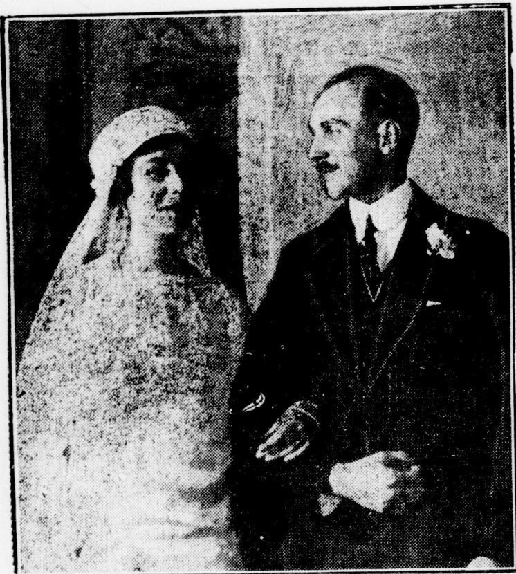
A photograph of Prince and Princess Vigo of Denmark taken immediately after their marriage at Calvary Church, New York City