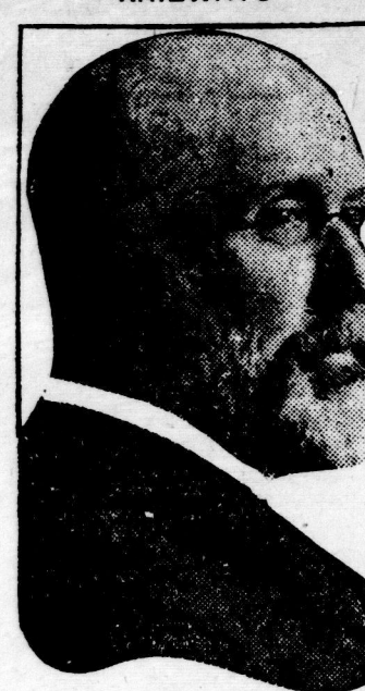
SIR JOSEPH FLAVELLE, Bart., who is expected to be chairman of the Canadian National Railway board of directors.