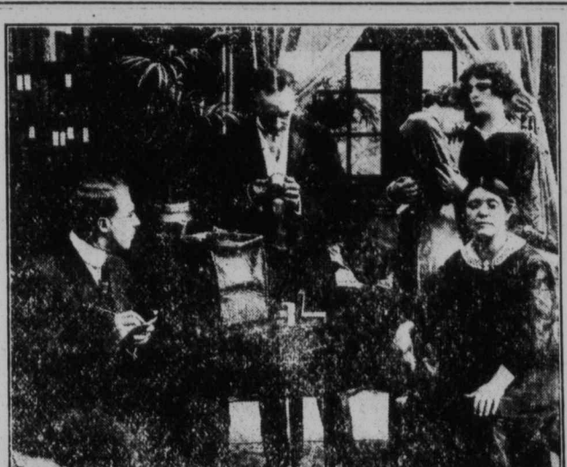
by the World's Film Corp. at the Happy Hour Friday night.