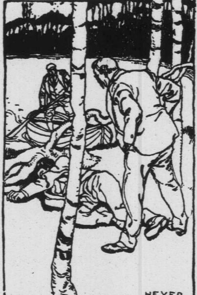
At Sercombe's feet was a prostrate figure, to make out what this might be I heard the approaching feet of the others.

SEEK TO CRUSH LIQUOR TRAFFIC. London, Ont., Dec. 7.—The temperance party in London will have a hand in the municipal election. It is the intention of the league to interview all candidates offering themselves for aldermanic honors, and to bind them to a temperance pledge. It is not the intention to ask any reduction in the number of liquor licenses next year.