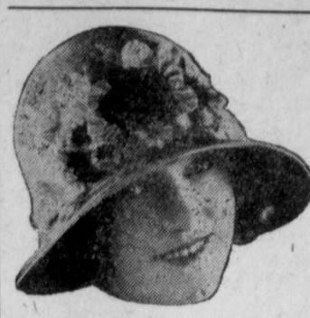
Isn't this a pretty hat?

and I saved money buying it direct from Hallam's by mail, in fact I buy most of my clothing from Hallam's now and have never had as good satisfaction.