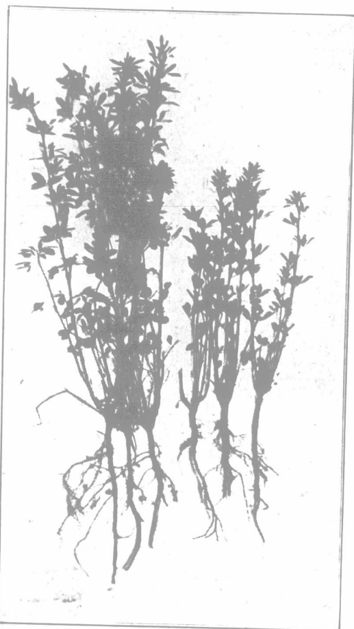
Inoculated and Uninoculated Alfalfa.

It is a well-known fact that mold-infected butter becomes unsalable in a comparatively short time, and involves not only heavy financial losses and unpleasant business relations, but also a serious loss of prestige and standing on the market of the person or firm who make and sell such butter. It is important, therefore, that everyone who handles butter, either as a manufacturer, or as a dealer, should know something about the nature of mold. He should know the conditions which are favorable and those which are unfavorable to its growth. Such knowledge will enable him not only to successfully check the scourge when present, but also prevent its further growth.