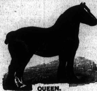
QUEEN. Calves. Write for prices or come and see