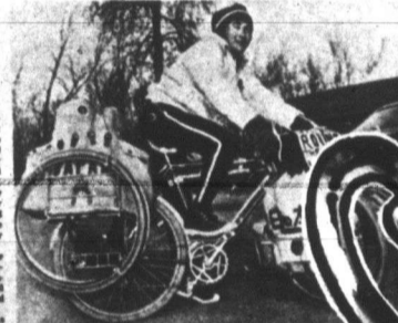
Resident being assisted for the construction, cycling is one of the most popular ways of travelling around the world.