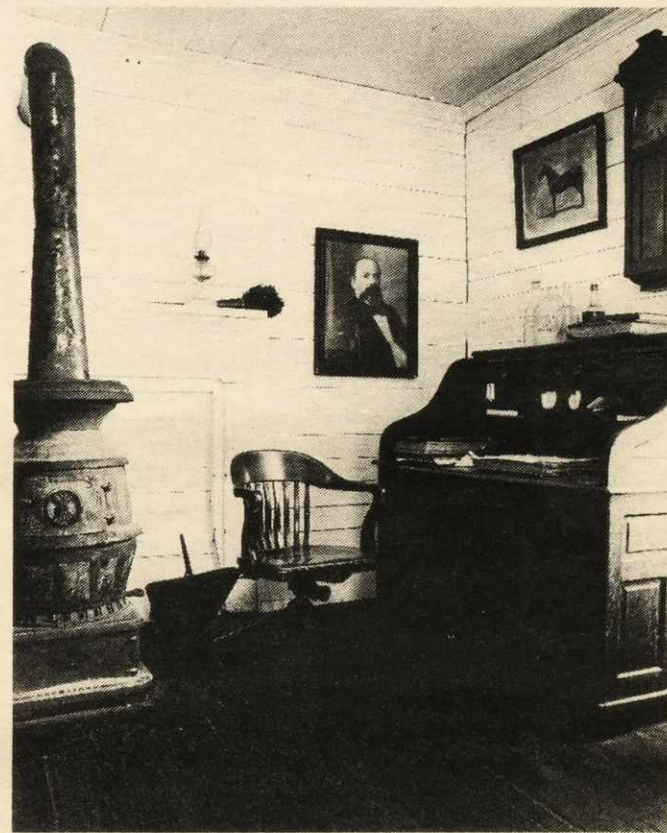
If you'd like a booklet about Jack Daniel's Whiskey, write us here in Lynchburg, Tennessee 37352, U.S.A.

NO ONE IN LYNCHBURG knew why Jack Daniel missed work that spring day in 1904.