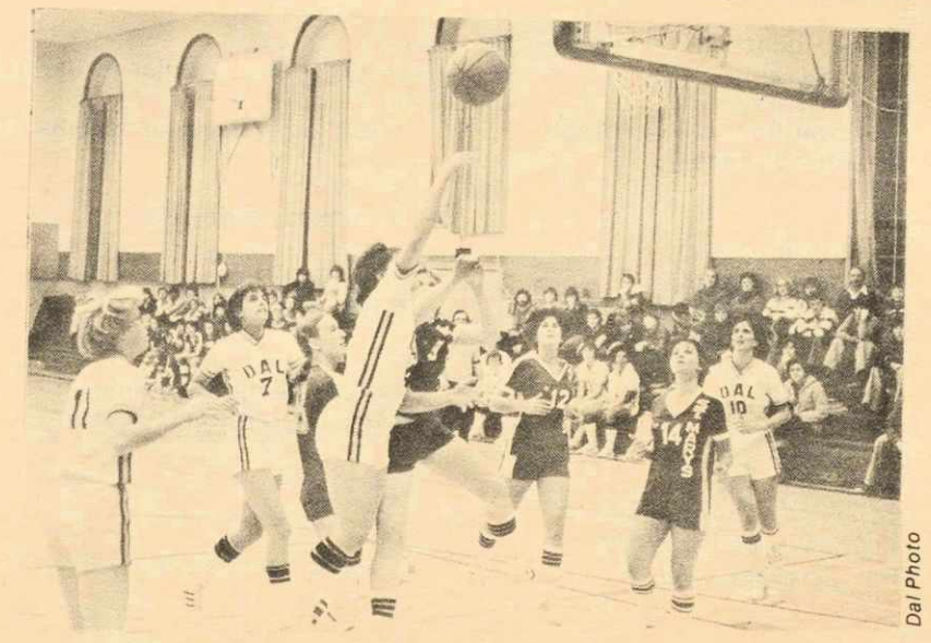
The Dalhousie Women's Basketball Team played Saint Mary's in the Dal gym last night.

A trip to Waterloo and London this week-end will give an opportunity to establish this key area. The Tigers drew national finalists Lakehead in the first round of the Naismith Classic and look forward to formidable foes such as SMU. Carleton, Waterloo and McGill in later rounds of the eight team affair. On Sunday, they play Western in London. Upon Dal's return, they go to Wolfville for a league game with Acadia Wednesday, November 30th.