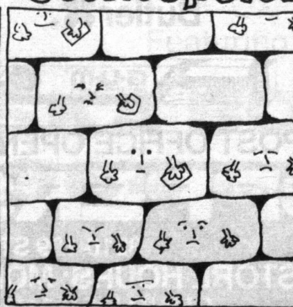
WHAT YOU WILL LOOK LIKE TO YOUR PROFS