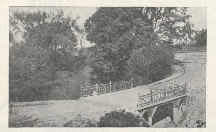
The Land Lends Itself to Just Such Beauty Spots as This Rustic Bridge in Alexandra Gardens.

A High Class Suburban Residential District --- Charming Situation --- An Ideal Homesite Section