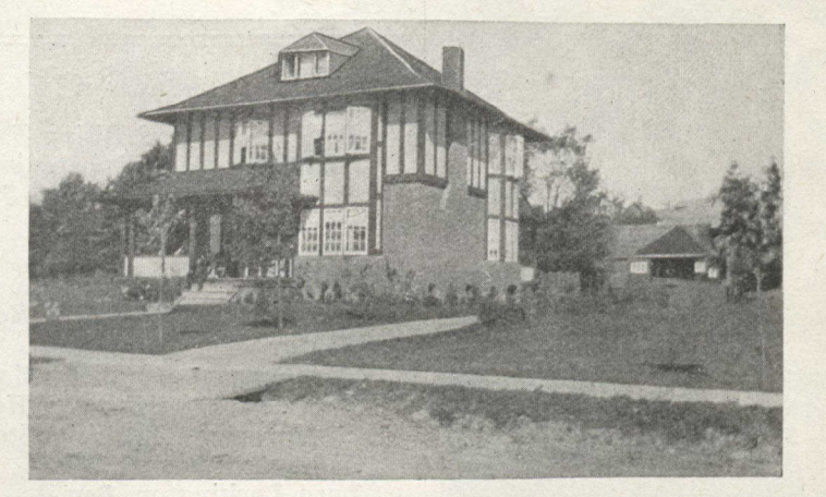
This is One of the Beautiful Homes in the Alexandra Gardens, Adjacent to the Park.

BRIAR HILL PARK will in the near future have exceptional transportation facilities. Stop 19 on the Metropolitan Radial line is but a few steps from the property. It is expected that a line will be constructed on or near Avenue Road through BRIAR HILL PARK, and the prospects are that within a short time a line will be constructed on Bathurst Street to the west of the property, and any one of these lines will carry residents to the heart of the city vithin half an hour.