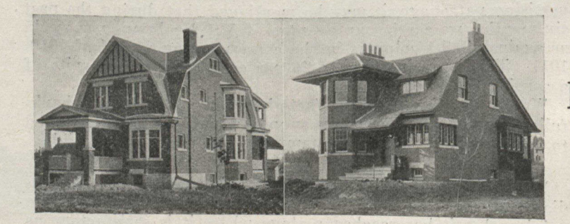
Showing the Class of Residences in Course of Erection in This Delightful Suburban District.

Lots are Selling To-day at $15.00 a Foot and Upwards The Trusts and Guarantee Company, Limited Manager for the Owners 43-45 King Street West, Toronto Phones Main 7475 and North 3571