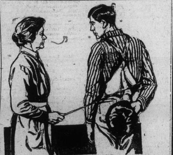
Jack Pickford "In Wrong," Seven Reel Special Thursday, Friday and Saturday at the Star.