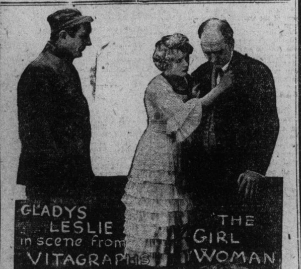
Star Theatre, Monday, Tuesday and Wednesday.