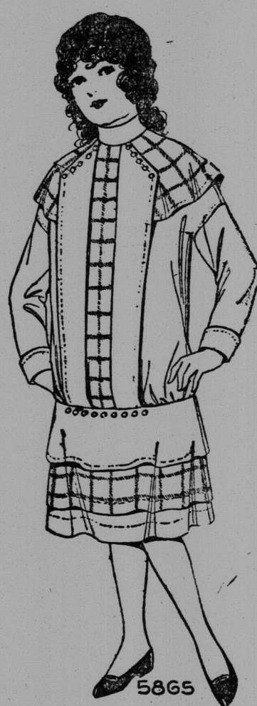
Smart model for a school girl's dress, made with a shoulder cape and vest of plaid silk, combined with blue serge.

Frocks for girls ranging, according to school age from first year to intermediate, are of unusually attractive design this season. The cape effects that are featured in older models find ex-