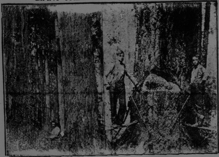
The natural resources of British Columbia are almost unlimited, fisheries, mines and forests yielding huge fortunes every year. The picture shows the size of some of the trees in the B. C. forests, and the way they are being cut.