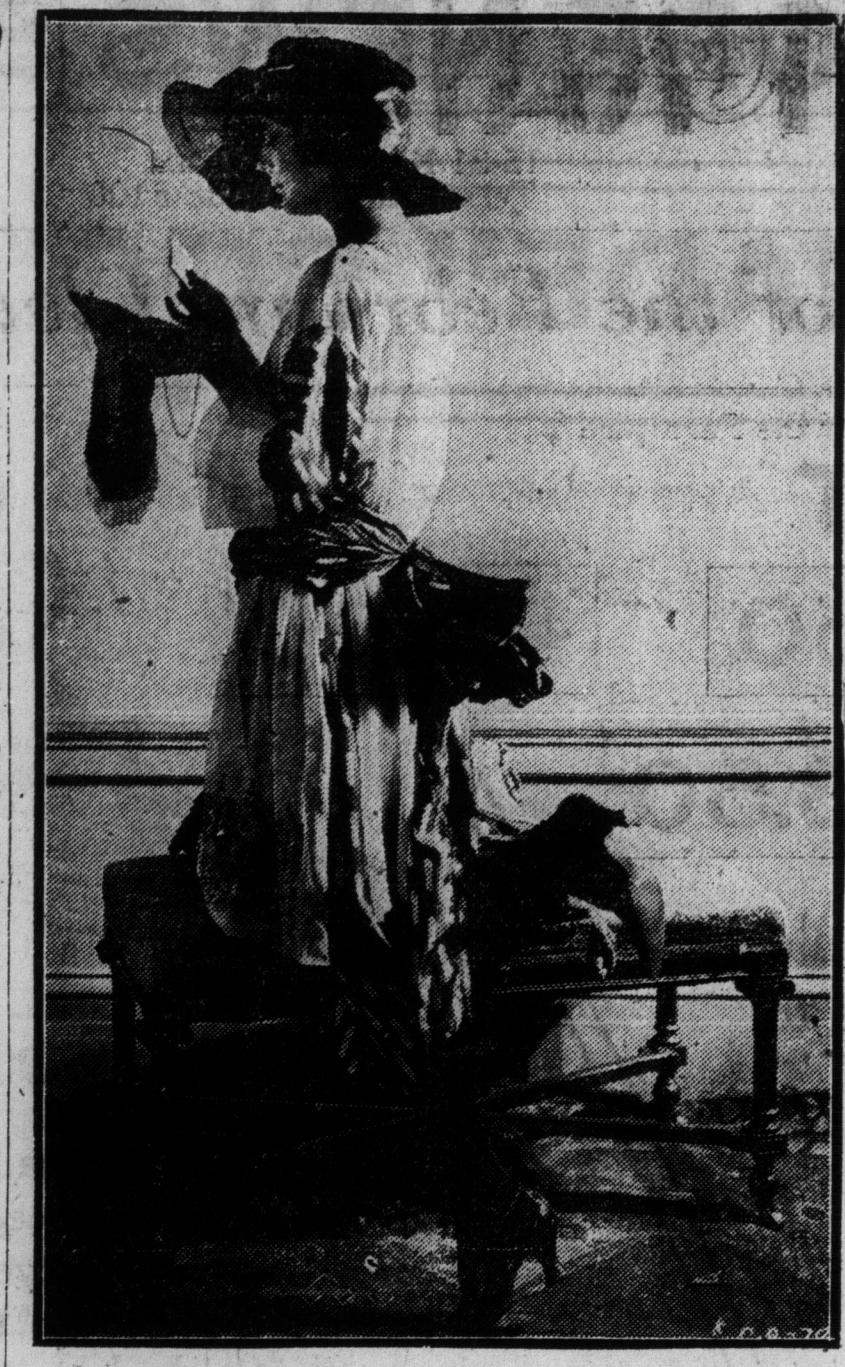
This dainty afternoon gown is developed in a combination of ecru georgette and blue and white foulard. The hand embroidery enhances the beauty of the georgette bodice, which contributes to the youthful_charm of this gown.

CHARMING AFTERNOON GOWN FOR SOUTHLAND AND SPRING WEAR