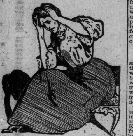
remedies and tried, oh, so many of them, growing weaker with the worry and always the shadow of death or insanity before me. I saw my children grow away from me. I saw my friends in which I could not join. My music, books and friends were no more to me. I wanted to be alone. I grew irritable. I would almost cry my eyes out without knowing why. Then would come remorse and I would clutch my hands and make up my mind that I would not be sick but faith cures don't seem to work with a suffering woman. At last I was told I could not get better and then my mind began to go the way of my poor, sick body, and I had no more to say. I knew in my heart the asylum and the grave would have claimed me.