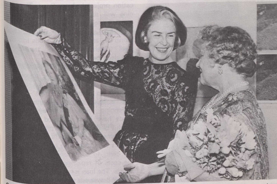
Sidney Harris Limited