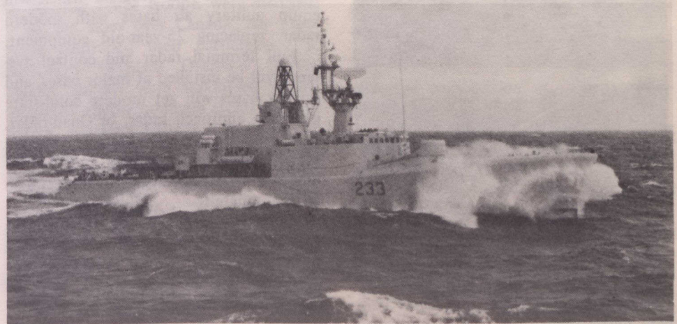
HMCS Fraser is one of six, aging St. Laurent Class destroyer escorts which will be replaced by new Canadian patrol frigates when the construction phase of a shipbuilding program gets under way in 1981.

Ten years ago today, Yellowknife became the capital of the Northwest Territories.