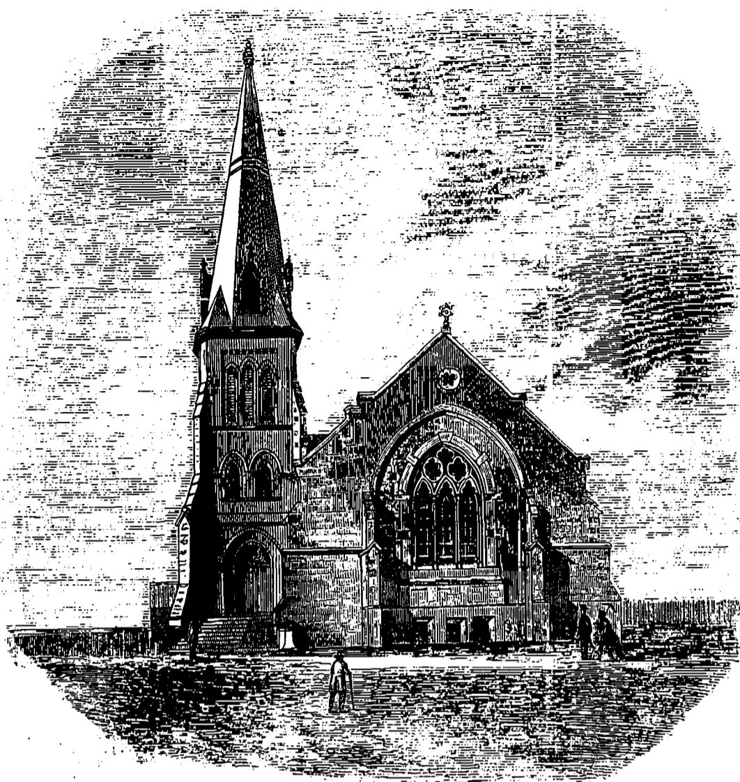
ST. ANDREW'S CHURCH, FERGUS.

A statement has been issued showing the comparative strength of the Danish and Prussian navies, from which it appears that the navy of Denmark mounts 768 guns, and that of Prussia 390. The corps of officers shows a numerical superiority in favor of Denmark.