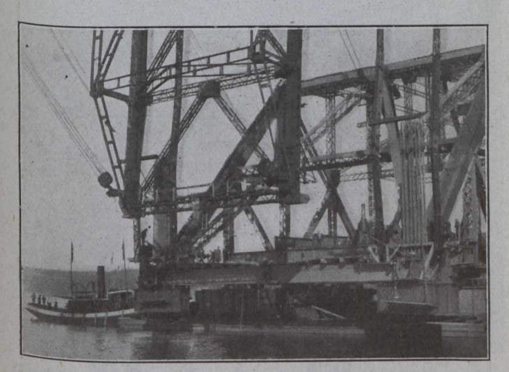
Fig. 1.—Connecting the South End Hanger Chain; to Stub Links of Lifting Girder. Engaging the Leafs Before Driving Lifting Pin

Last Saturday morning, September 15th, was the date finally determined upon for the floating of the span, pro-