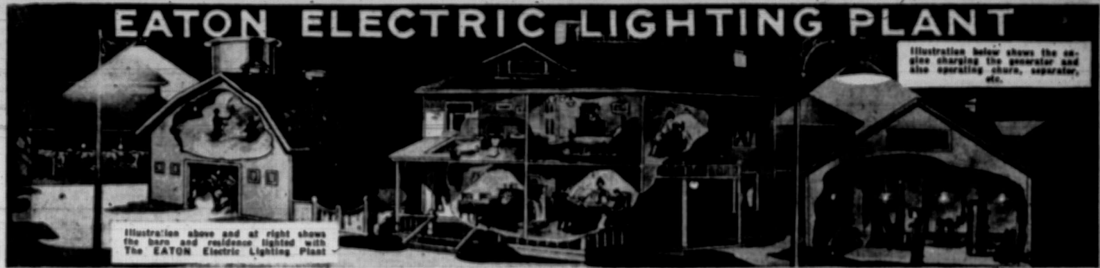
Illustration above and at right shows the barn and residence lighted with The EATON Electric Lighting Plant