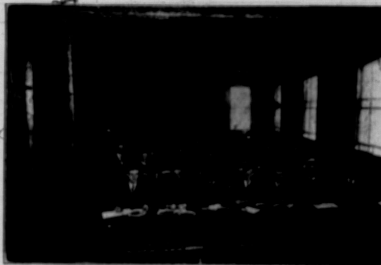
Students in Agronomy Class Judging Grain

The war with its problems has brought greater responsibilities for every one of you. How are you planning to prepare yourself to meet these responsibilities? You must be prepared to meet not only your personal future but to take your part in the future of the nation, the community, the farm and the home. In all these interests, leaders, trained and capable, will be needed—leaders who have knowledge and skill, and who are trained to think clearly and to act justly.