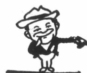
Geo. Wright & Co., Props.