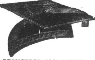
REGISTERED TRADE MARK.

Liberal terms to the Clergy. 103 YONGE STREET, TORONTO.