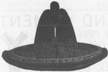
Design No. 1007.

Very Neat and Artistic For Man and Beast.