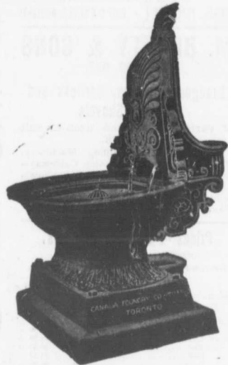
Design No. 1010

Very Neat and Artistic For Man and Beast.