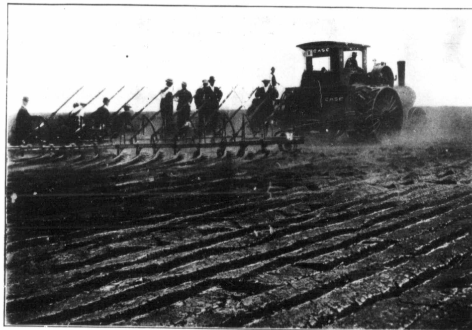
GOLD MEDAL WINNER IN HEAVY STEAM ENGINE CLASS USING 12-FURROW COCKSHUTT ENGINE GANG

MORE COCKSHUTT ENGINE GANGS IN USE AT THE ENGINE COMPETITION THAN ANY OTHER MAKE THE WORK DONE SURPASSED ALL OTHERS AND ELICITED THE STRONGEST PRAISE FROM SPECTATORS