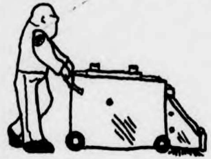
The Cleaning Machine..