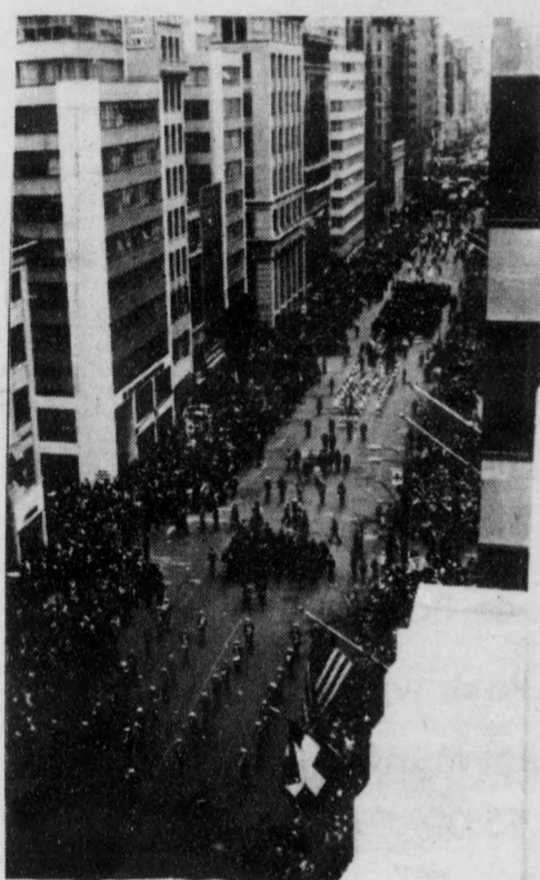
The 1979 St. Patrick's Day parade as it passes Rockefeller Center.