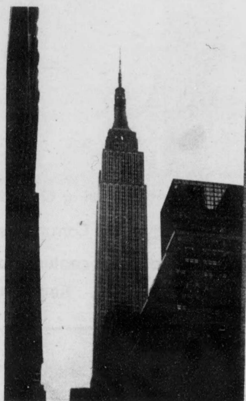
No longer the tallest, the Empire State Building still symbolizes the Manhattan skyline.