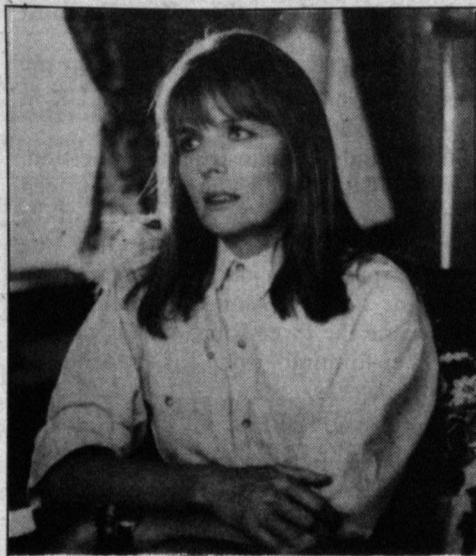
Diane Keaton fights a child custody battle in The Good Mother .