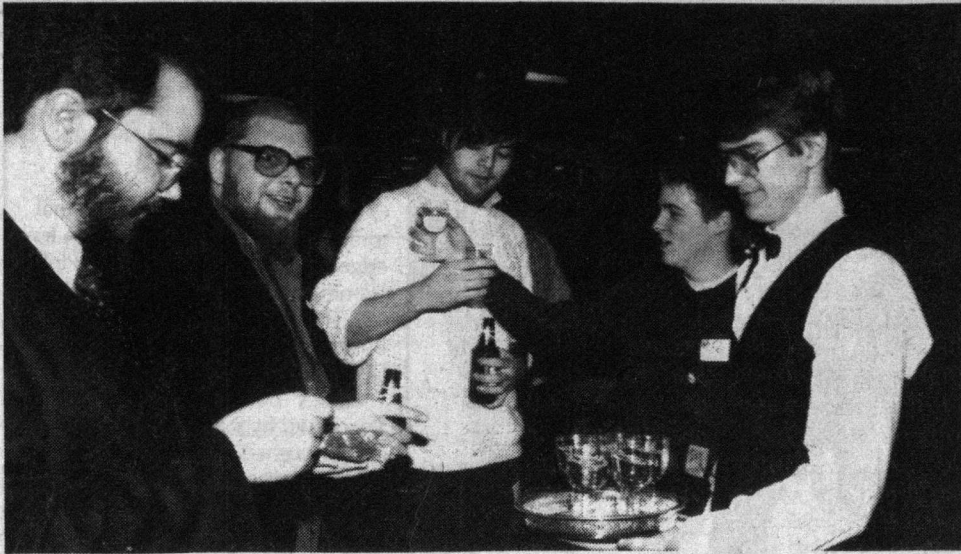
Free drinks were the order of the night as CJSR hosted a media bash last evening.