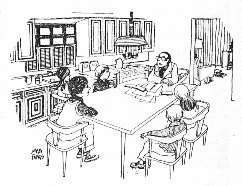
"I've called the family together to announce that, because of inflation, I'm going to have to let two of you go.

year's Students' Council should note that while they are still free to write letters to the Gateway editor, they may not indicate their political candidacy or they will be disqualified. Candidates will be allowed to write 150 word policy statements for the Feb. 3 and Feb. 8 issues of Gateway but may not otherwise broadcast their political intentions through the pages of our paper.