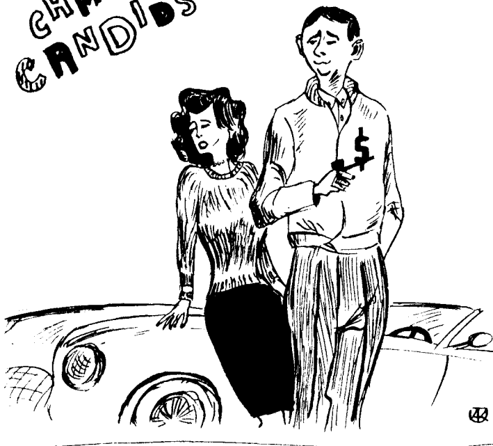
This is a STUDENTS' COUNCILLOR . He spends your money carefully. Sometimes he uses it to go on trips. These trips help you. They are good fun. Aren't you glad the students' councillor helps you have fun?