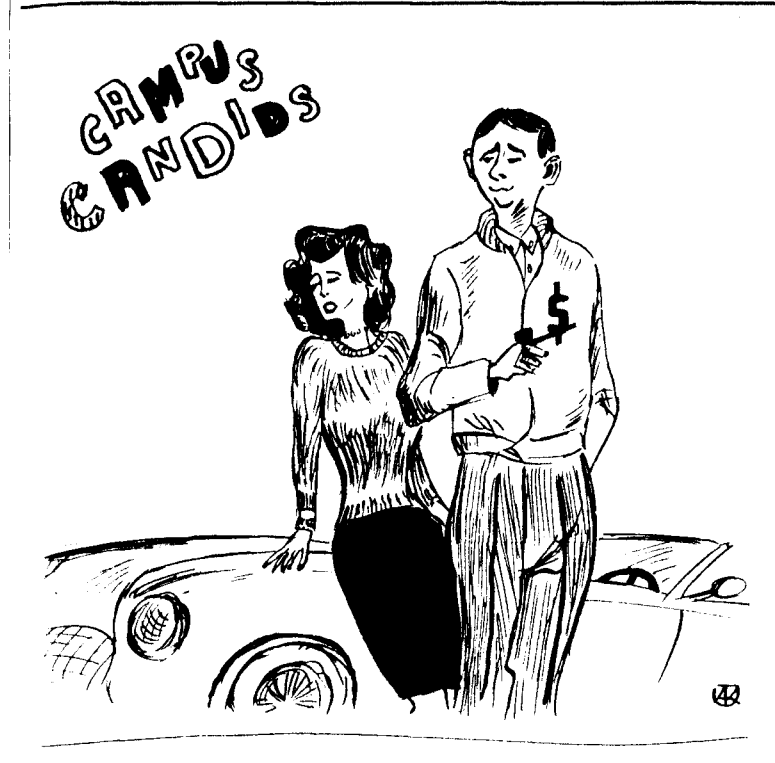
This is a STUDENTS' COUNCILLOR . He spends your money carefully. Sometimes he uses it to go on trips. These trips help you. They are good fun. Aren't you glad the students' councillor helps you have fun?