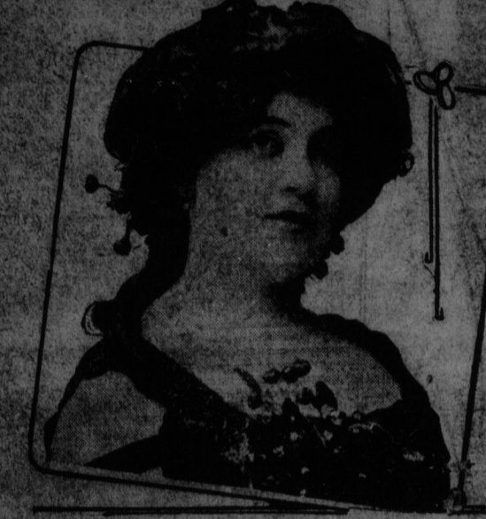
LAST PHOTOGRAPH OF MURDERED WOMAN.

WIDER RACED THROUGH WIFE. Clerk Who Stole $500,000 in Bonds From Russo-Chinese Bank Arrested in Restaurant—Sent To Tombs.