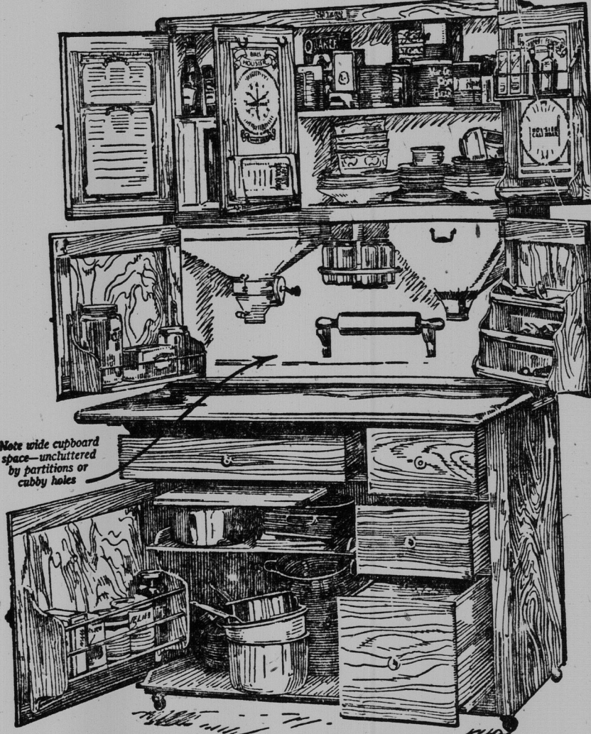
This is "HOOSIER BEAUTY" The National Step Saver

THE BEST XMAS GIFT YOU CAN GIVE THE WOMEN FOLK