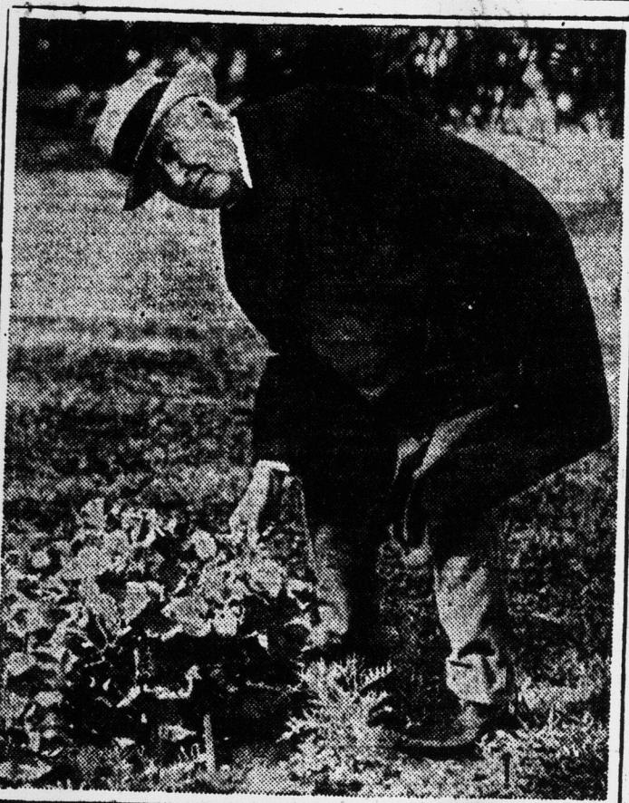
Thomas A. Edison, "electrical wizard," is venturing into Luther Burbank's field, this new photo of him, taken on his 79th birthday, suggests.

mits a crime, his punishment falls heavily on his family and friends. The court has in its possession a number of communications from persons who know you and your father and mother, and speak in the highest terms of the home influence and life your parents gave you. You have suffered, I've no doubt, I believe you, I am not at all influenced by publicity or by this crowded court room. I wish to give you such a penalty as will be fair and just to the people and reasonable to you. I cannot suspend sentence upon you."